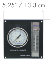
Remote Monitoring Panel Depth 1.63" / 4.1 cm