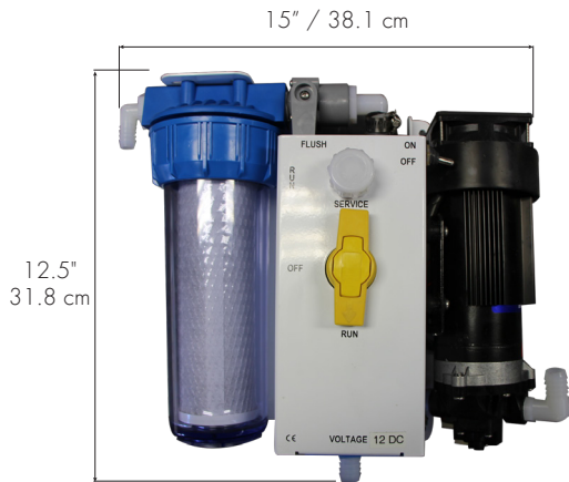
Feed Pump Module Depth 4.5" / 11.4 cm