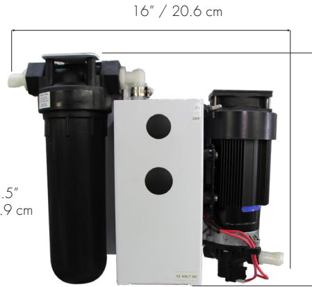
Secondary Feed Pump Module Depth 6" / 5.2 cm